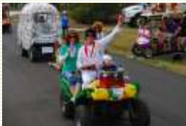
16 th Annual Golf Cart Parade